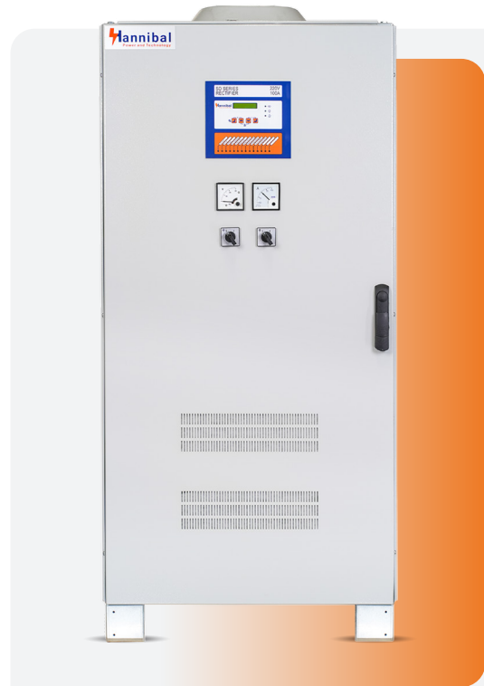
Example for Rectifier 125 VDC-150A